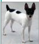
Toy Fox Terrier

Some interesting information about Puppy Sensory testing was discussed, to make confident little dogs and we all learned that raspberry leaves are a good addition for any bitch that is either already pregnant or we hope for them to become pregnant. The reasons why were well discussed and we have all cleaned out the health food stores and bulk bins around Nanaimo to stock up. Did you know that crushed almonds are good for males with low sperm count?